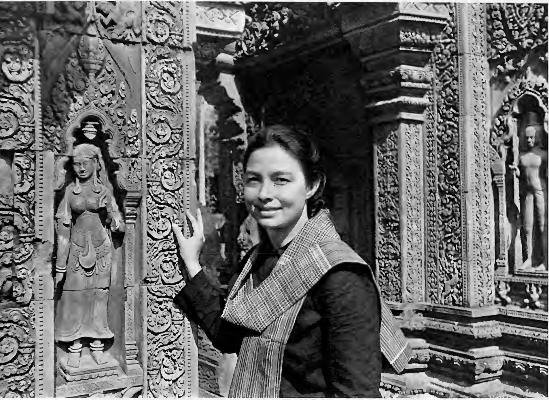
Madame Sihanouk in front of the elaborate carvings.